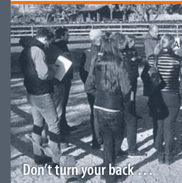
Don't turn your back ...

Practical diagnostic work-up and discussion of treatment options of orthopaedic conditions