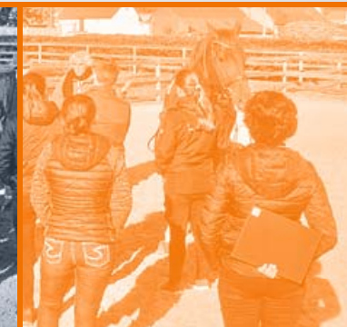
... on the facts on the back!